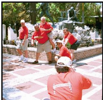
PHOTO THEME HUNTS

This is by far the most popular package. In this version of the hunt, your group will solve creative clues and use their own smart phones to complete Key West inspired and interactive photo challenges. The photos capture the action and create fun souvenirs for everyone. At the end, a photo board display will accompany an exciting “Best of Show” presentation along with the announcement of the winners. You get to keep all the photos along with a CD of all the images.